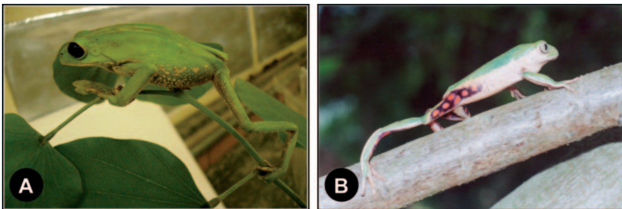
Figure 1. A , adult male of Phyllomedusa camba from Ministro Andreazza, R ndonia (RO); B , Phyllomedusa rohdei from Biritiba-Mirim, S o Paulo (SP).

The mitotic chromosomes were obtained from direct preparations of bone marrow, liver and testis treated with 0.01% colchicine at a proportion of 0.1 ml/10 g body weight, as described in Baldissera et al. (1993) and Silva et al. (2000), or from the intestine using the technique in Schmid (1978). To improve the mitotic index, we injected phytohemagglutinin in some specimens before the colchicine treatment, at the proportion of 0.1 ml/10 g body weight, 48–72 h before sacrifice. Conventional staining was made with Giemsa 10% diluted in phosphate buffer pH 6.8, and silver nitrate labeling