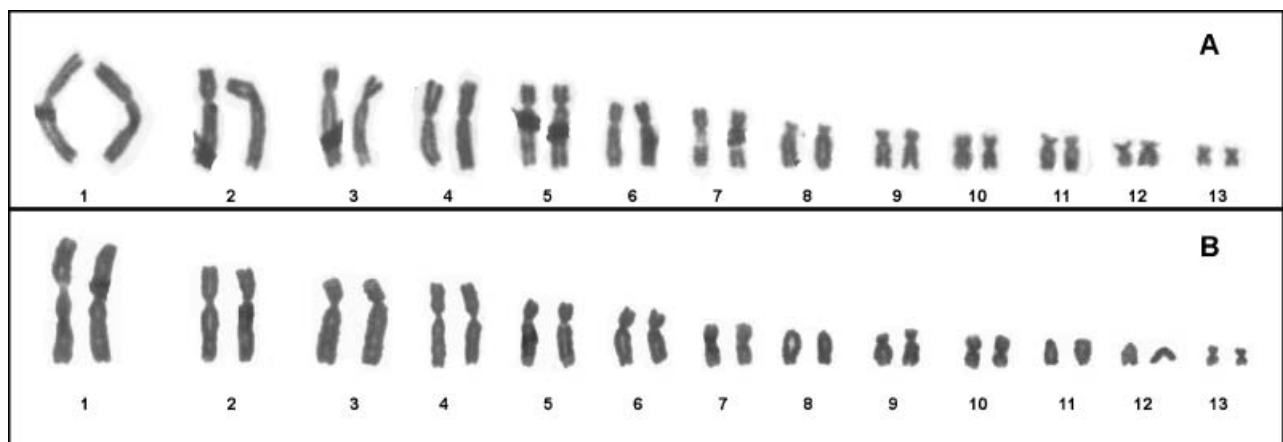
Figure 2. A , Giemsa-stained karyotypes of Phyllomedusa rohdei ; B , Phyllomedusa camba . Note three acrocentric pairs (8, 11 and 12) in P. camba .

In Anura, NOR analysis by silver staining has shown that species, in both primitive and derived families, possess only one pair of Ag-NORs in their diploid karyotype (Schmid 1982; Mahony & Robinson 1986). This observation led King et al. (1990) to suggest the presence of only a single pair of Ag-NORs in diploid karyotypes as an ancestral