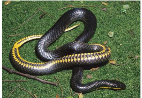
Figure 1. Adult example of Sordellina punctata (female from São Paulo-SP).

Hoge (1958) wrongly cites “São Bento, Staat São Paulo, Brasilien” as the type locality of Sordellina pauloensis Amaral, 1923 – a junior-synonym of Sordellina punctata (Peters, 1880). São Bento (now São Bento do Sul) is a city in the state of Santa Catarina, given by Afrânio do Amaral as the type-locality of Atractus trihedrurus , a species described as new in the same paper (Amaral, 1926) where a description (in