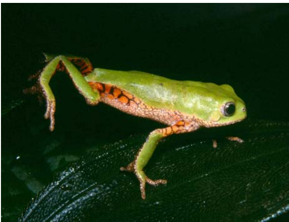
Figure 1. Adult of Phyllomedusa ayeaye from the type locality, Morro do Ferro, Minas Gerais, Brazil.

Phyllomedusa ayeaye (Figure 1) is a medium-size hylid treefrog described as Pithecopus ayeaye by B. Lutz (1966). The present known distribution of this species is limited to the type-locality: Morro do Ferro (21°48' S, 46°35' W; 1400-1540 m), municipality of Poços de Caldas, state of Minas Gerais, southeastern Brazil. Cardoso et al. (1989) studied the utilization of resources for reproduction in an anuran community of this area and described some ecological aspects of P. ayeaye .