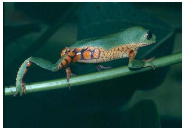
Figure 2. Adult male of Phyllomedusa ayeaye from Parque Nacional da Serra da Canastra, Minas Gerais, Brazil.

During field work at Parque Nacional da Serra da Canastra (approximately 20°10' S, 46°30' W; 900-1496 m), Municipality of São Roque de Minas, state of Minas Gerais, southeastern Brazil, on April 1998, two males and a post metamorph of Phyllomedusa ayeaye were collected (Figure 2). The vegetation at this park is composed by well preserved cerrados (Brazilian savanna; Ratter et al. 1997), campos rupestres (open vegetation on rocky soil; Magalhães 1966), and gallery forest lining the larger rivers (Haddad et al. 1988; Romero and Nakajima 1999). This new record for Minas Gerais extends the distribution of P. ayeaye approximately 175 km to the north of Morro do Ferro, Poços de Caldas (Figure 4).