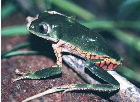
Figure 3. Adult male of Phyllomedusa ayeaye from Parque Estadual das Furnas do Bom Jesus, São Paulo, Brazil.

they were collected is a transition between typical cerrado ( cerrado sensu stricto ; Ratter et al. 1997) and secondary semideciduous forest (Franco et al. 2007; Oliveira-Filho and Fontes 2000). This new record for the state of São Paulo extends the distribution of P. ayeaye approximately 200 km to the northwest of the type-locality (Figure 4).