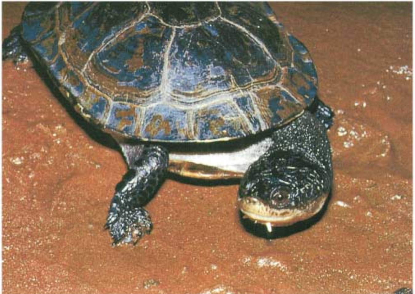
Figure 2. A juvenile female of the Vanderhaege's toad-headed turtle, Phrynops vanderhaegei , captured at Itirapina, São Paulo state, southeastern Brazil Photo: R. J. Sawaya.

(IVERSON, 1992; IVERSON, pers. comm. ), which is the easternmost known limit of its distribution (Figure 2). We found the Vanderhaege's toad-headed turtle at "Estação Ecológica de Itirapina" (Itirapina Ecological Station; hereafter Itirapina), which is located within the municipalities of Itirapina and Brotas (22°15' S, 47°49' W), São Paulo state, southeastern Brazil (Figure 1). This locality is about 180 km west of the Perú/Caieiras record. The Itirapina reserve is a 2300 ha tract of savannas ( cerrado ), from grasslands to dense arboreal formations, with small stretches of riparian forests (GIANOTTI, 1988; pers. obs. ).