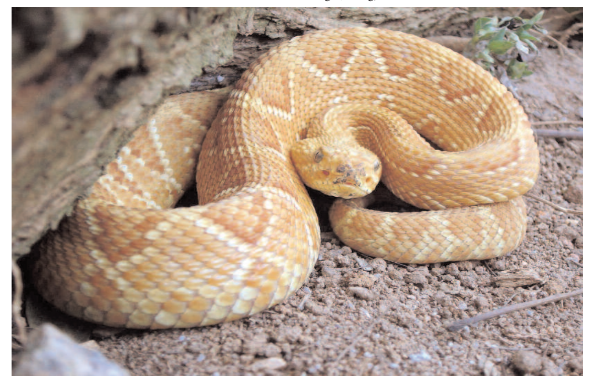
Figure 1 . Crotalus durissus terrificus with xanthism. Female (500 mm in snout vent length, 35 mm in tail length, 100 g).

Snakes of the genus Crotalus are terrestrial ambush predators; their most salient characteristic is the presence of a rattle in the tip of the tail. In Brazil there is only a single species, Crotalus durissus, which has a large distribution within savannah (cerrado), arid regions (caatinga) and open areas (Melgarejo, 2003). There are a few reported cases of albinism in this species (Amaral, 1927a; Amaral, 1932; Amaral, 1934; Duarte et al., 2005) and also melanism (Silva et al., 1999). This note reports a case of xanthism in a specimen of Crotalus durissus terrificus. The snake, a young female (500 mm in snout vent length, 35 mm in tail length, and 100g), was collected in Lindóia – SP (22°31'S; 46°39'W) in July 2005, with two other individuals of a similar size, but with normal colour patterns. This individual is yellow throughout the entire body, including the head, with lighter stains in the postocular region. The characteristic dorsal markings are dark yellow, bordered with scales of lighter yellow. The nape marking is also dark yellow, bordered by light yellow scales, and the gular region is light