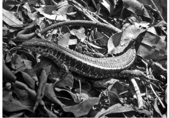
Figure 1. Zonosaurus laticaudus . Spet Lacs, 2005.

This paper intends to add to this current knowledge by documenting the behaviour of individuals from a population located in the south of the island. In particular, it draws attention to previously undocumented observations and highlights how (together with the existing ecological knowledge detailed above) they may have contributed to the current wide and disjunct distribution of this species across Madagascar.