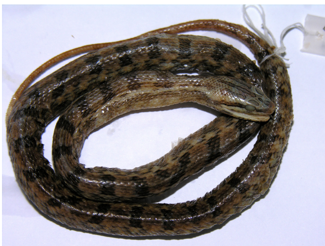
FIGURE 1. A male specimen of Tropidodryas striaticeps (MZUEFS 1168) collected in the municipality of Feira de Santana, State of Bahia, Brazil.

The compiled data (Table 1) presented here shows that T. striaticeps is more abundant (N = 257 records, 73.2%) in higher altitudes (144 records of T. striaticeps in intermediate altitudes from 251 to 750 m a.s.l and 113 records above 750 m a.s.l.), with the maximum elevation recorded at 1052 m a.s.l. at Ouro Branco municipality, state of Minas Gerais (20°31'14" S 43°41'29" W, São-Pedro and Pires 2009). These data corroborate the literature (Thomas and Dixon 1977; Argôlo 1999b; Marques et al. 2001; Marques et al. 2009). However, our records of other 94 specimens (26.8%) indicate that T. striaticeps also occurs in lower elevations (0 to 250 m a.s.l.), from the sea level in Ribeirão do Largo, state of Bahia (15°28' S, 40°45' W, CZGB 6419, Argôlo 1999b) up to 250 m a.s.l.