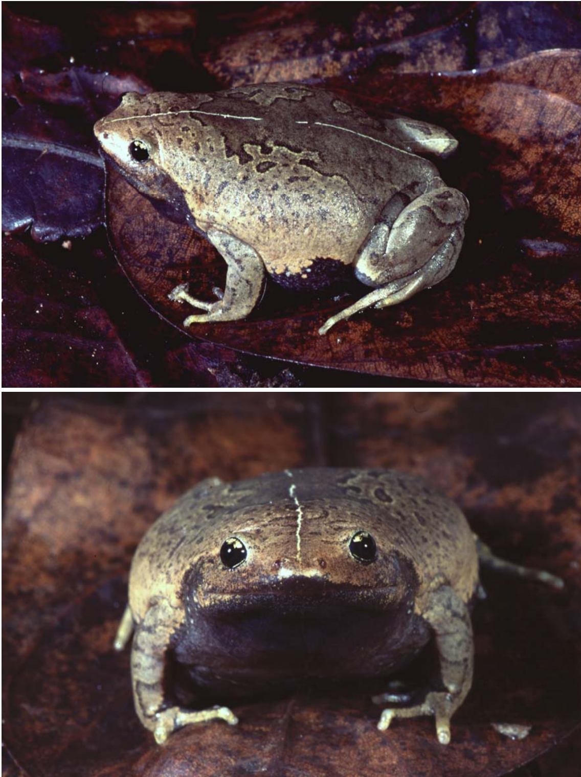
Figure 1. Lateral and frontal views of Stereocyclops parkeri from Ilha de São Sebastião, Ilhabela municipality, São Paulo state (CFBH 13252).