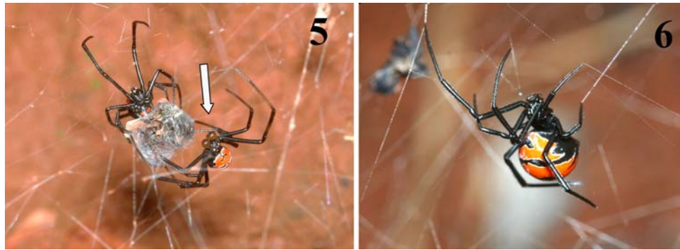
Figs. 5, 6 Fig. 5. Two immature individuals capturing a prey. Above a juvenile female. Below a penultimate male. Fig. 6. Detail of the colony's largest female

aggression by the individuals was seen. The behavior was repeated again after the introduction of additional beetles. After maturing to adulthood males and females continued to co-occupy the web eating together in the same way. The prey was eaten in the place of capture.