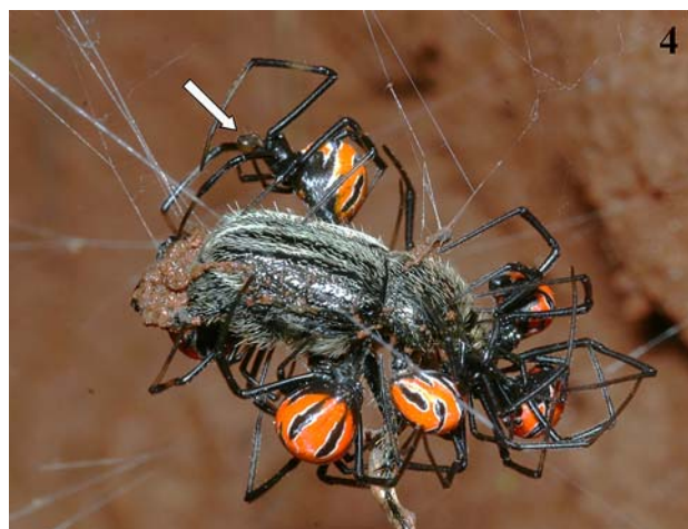
Fig. 4 Several immatures eating a beetle. White arrow indicates a penultimate male, note the enlarged palps

An old egg sac with several small shedding skins was noted in the left upper web corner (Figs. 1, 2). In the right center margin an adult beetle was being communally eaten by seven spiders (Figs. 3, 4). Among these were some subadult males. In another part of the web was another prey being wrapped by a subadult male and a small female (Fig. 5). A wrapped ant was observed in one side of web. There were several Ischnothele annulata Tullgren (Araneae, Dipluridae) webs around the Latrodectus colony, but no other aggregation of this species was observed on the same road bank and in its proximities. There was a female in the colony which seems to be the mother, since she was much bigger than the other individuals of the colony (Figs. 3, 6).